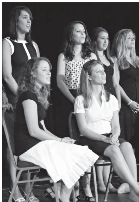
OYP alumni joined current performers on stage.