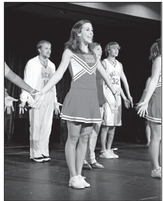
The audience got a preview of High School Musical .